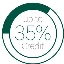
of Premiums Non-Profit Businesses

The maximum tax credit available is 50 percent of premium expenses as a for-profit employer. The maximum credit for tax-exempt employers is 35 percent. This credit applies to two consecutive tax years.* Small businesses must purchase health insurance through CCSB to be eligible for the tax credits offered.