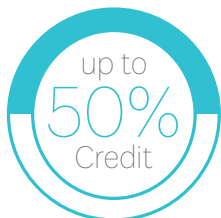
of Premiums For-Profit Businesses

The amount of credit you are eligible to receive works on a sliding scale. The smaller your business and/or the lower your annual average wage, the larger your credit will be.